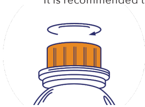
Step 1: Open the cap

It is recommended that Cavalor LaminAid be administered by syringe directly into the mouth.