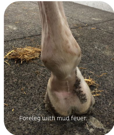
Foreleg with mud fever.