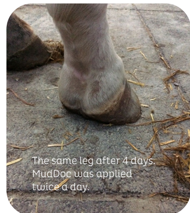
The same leg after 4 days. MudDoc was applied twice a day.