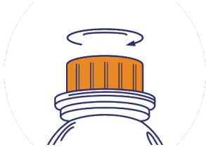
Step 1: Open the cap