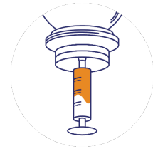
Step 3: Using a syringe, draw up the desired quantity